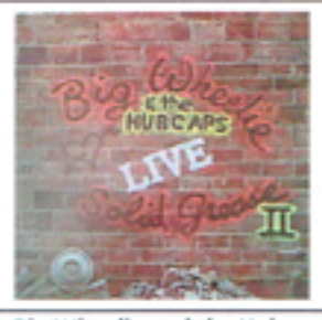
Big Wheelie and the Hubcaps