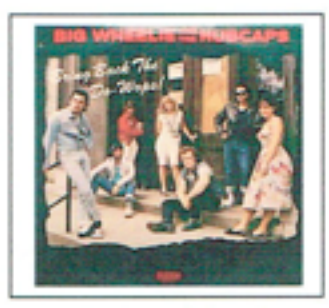
Big Wheelie and the Hubcaps