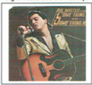
Big Wheelie and the Hubcaps