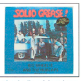
Big Wheelie and the Hubcaps