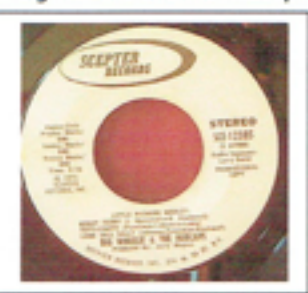
Big Wheelie and the Hubcaps